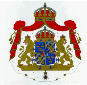
National Coat of Arms Sweden