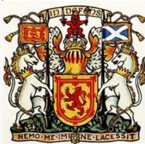
Royal Coat of Arms Scotland